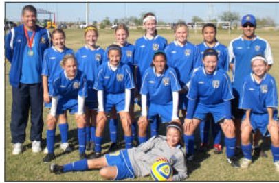
U11 Girls Gold take 2nd Place