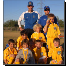
U8 Boys take 1st Place

Despite a partial tournament rainout, the Kohl's Christmas Angel Tournament continued through a variety of shootouts and short games. After Saturday's cancelled games, the rain finally subsided, the sun came out and Sunday was fabulous! But, it was then that the real storm began! Our AZSC Thunder rolled in and did an awesome job in representing our club well. Here are photos submitted by parents, along with our final standings: